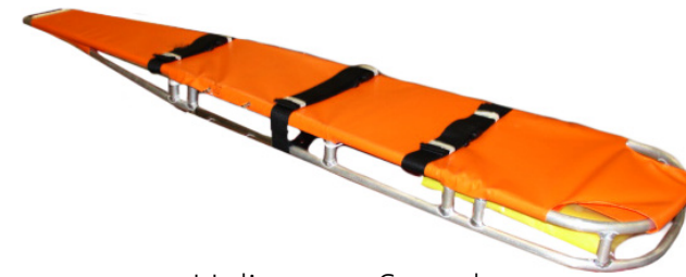
Helicopter Stretcher B-206