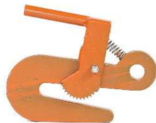
Safety Pipe Hooks SPH-03

Designed to grip pipe or casing for hands free operation.