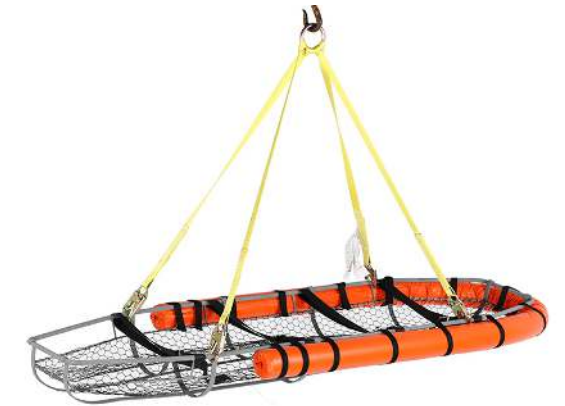
Wire Stretcher S-1