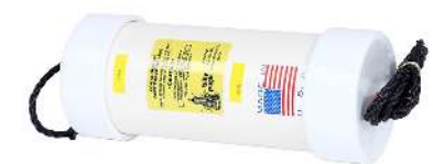
Containerized Fast Throw Line CTL-1