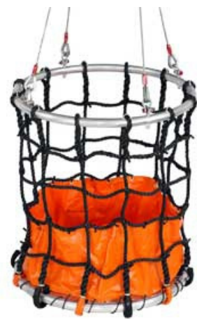
Personnel Work Basket PWB-2

The collapsible work basket is a lightweight man basket for applications where OSHA requirement is not applicable.