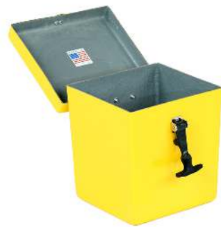
Utility Box UB-1