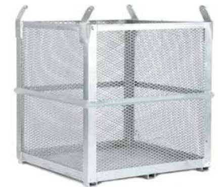
Rigid Cargo Basket 343

The DB-1 Derrick Basket is made for lifting personnel with a lightweight basket and retractable lifeline attached to fall protection harness.