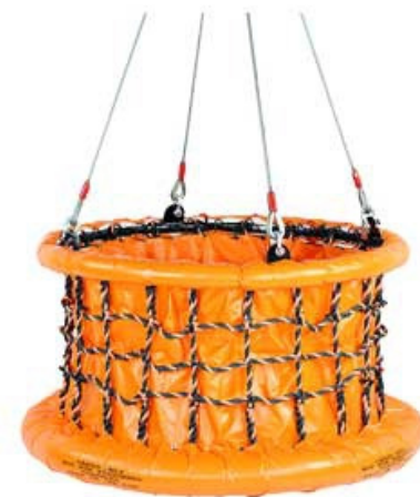
Collapsible Cargo Basket X-8CB

The collapsible work basket is a lightweight man basket for applications where OSHA requirement is not applicable.