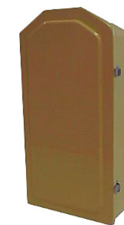
Breathing Apparatus Box BAB-3