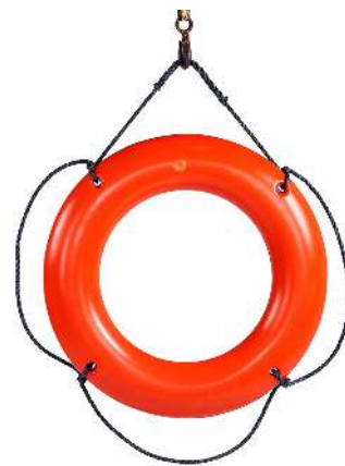
USCG Life Ring Buoy A-301