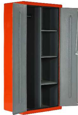
Storage Locker SL-1