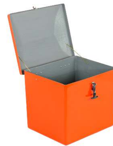
Life Preserver Box LFB-5