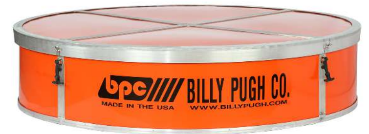
Personnel Net Box PNB-1-4