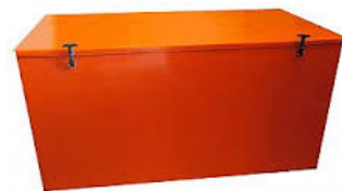
General Purpose Box OBB-200