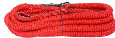
Tag Line PTL-1