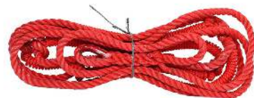
Swing Rope SR