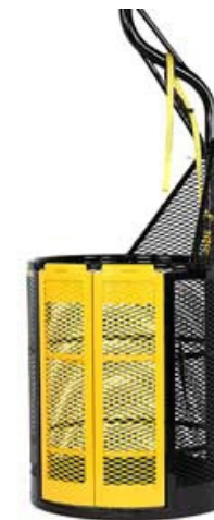
Derrick Basket DB-1

The DB-1 Derrick Basket is made for lifting personnel with a lightweight basket and retractable lifeline attached to fall protection harness.