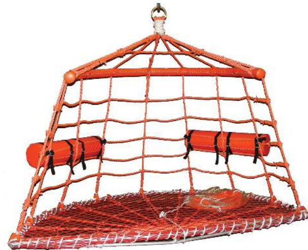
Boat Rescue Net X-544

The BPC X-544 is a boat davit or crane launched rescue system. Safe and effective for retrieving man overboard operations with the option of not putting a rescue swimmer in harm's way.