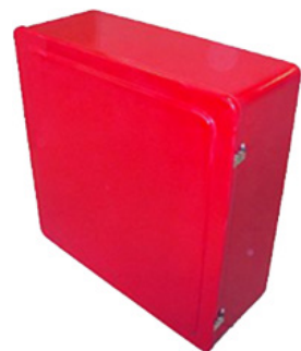
Fire Hose Cabinet FHC-300