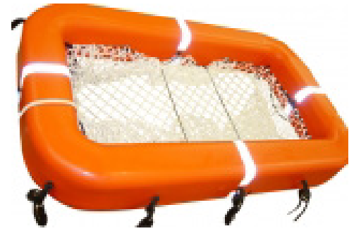
Life Float LF-12