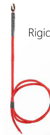
Rigid Tag Line RPTL-1