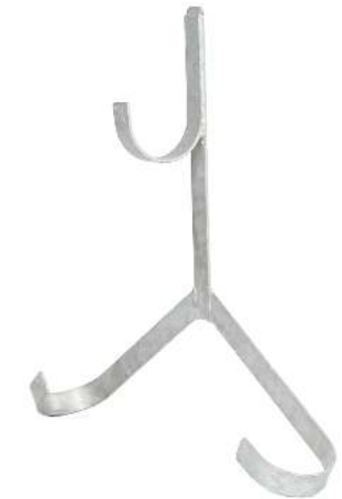
Life Ring Buoy Bracket B-30

Need a Quote today? find us at www.billypugh.com or call (361) 884-9351