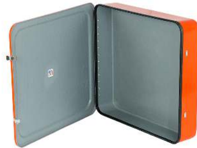
Ring Buoy Box RBB-30