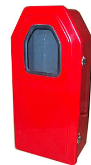
Fire Extinguisher Box FEB-1W