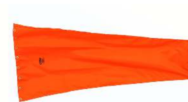
Wind Sock WS-18