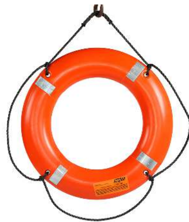
SOLAS Life Ring Buoy A-301S