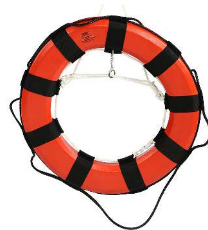
Rescue Ring RR-30