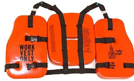
Work Vest WVO-50