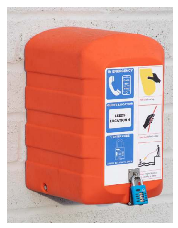
Shown with label and padlock which are not supplied